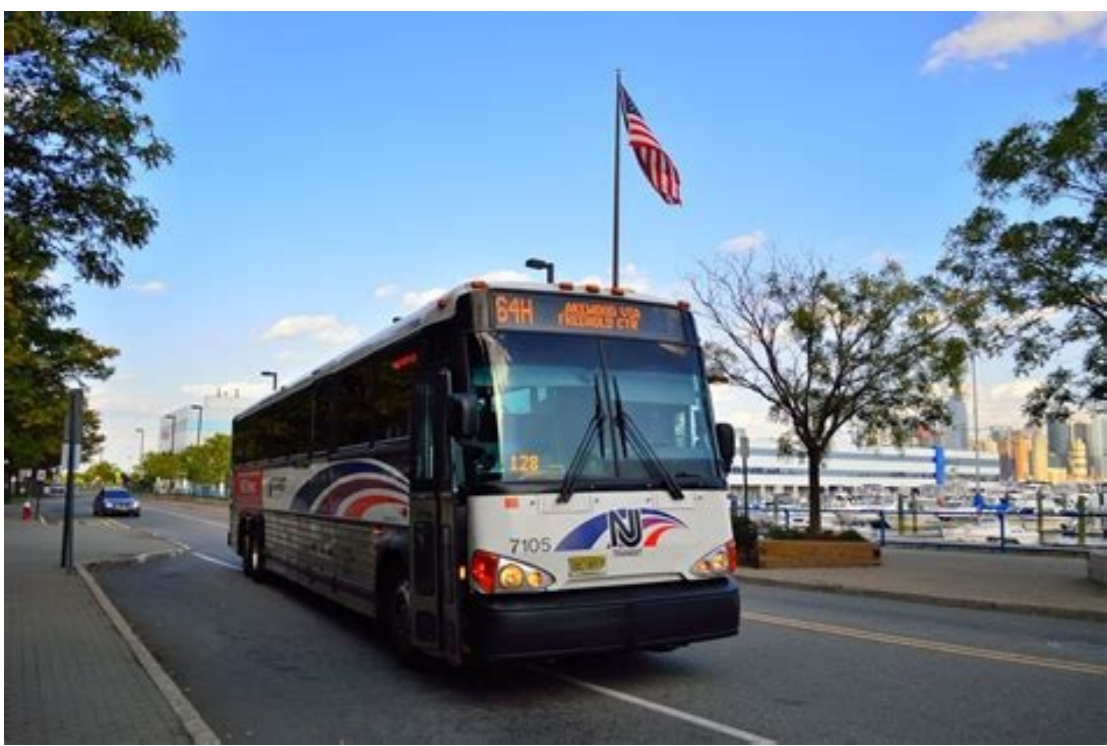
Nearest city to jersey city.